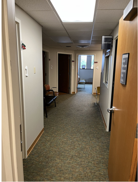
Hallway to the Treatment Rooms

They have painted and re-decorated some rooms, but some still look the same.