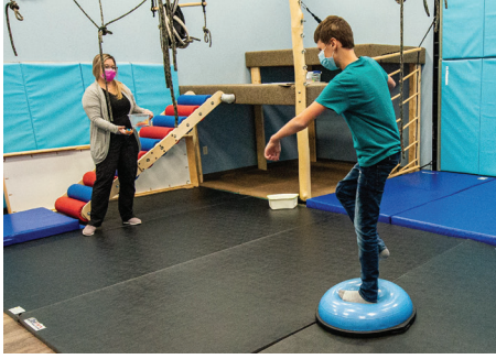
An occupational therapy visit in Ashland. A primary medical care visit in Hayward.